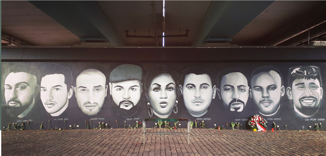
Four months after the racially motivated Hanau shooting this mural was unveiled at Frankfurt's Friedensbrücke to commemorate the victims.